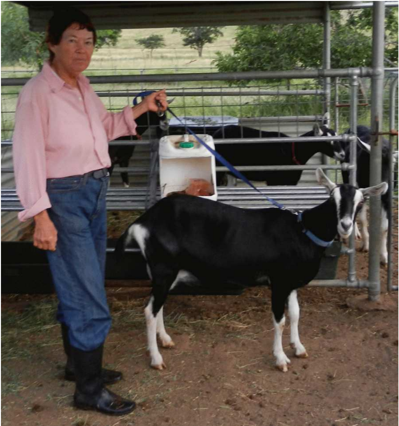
Another picture of Bluebell

To view in your browser, click the following link: http://damaras.com/newsletters/sr-171018.pdf