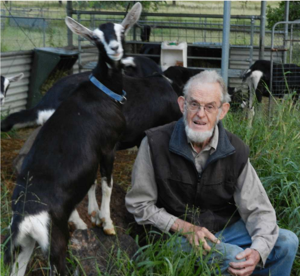
This is “Bella” talking to Rouseabout.

Our goats are very productive – we get all our own milk, cream, whipped cream, butter, cheese and kefir from them. They are easily trained and lovable. They do not climb fences, and are clean and fastidious in habits. Both healthy, CAE accredited, pure bred British Alpine. Neither goat has ever had any chemical drenches, anti-biotics or wormers, but they do get minerals, and a varied diet of sprouted grain, fresh carrots, hay and goat pellets.